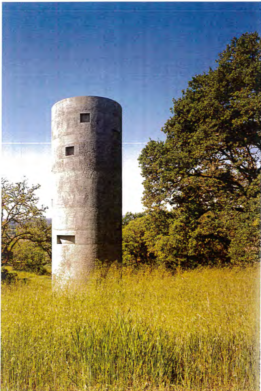
Oliver Ranch, 2003–07